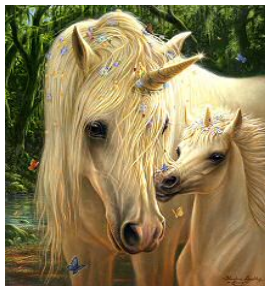
Mommy and Me

Region 2 2019 Championship Show Earl Warren Showgrounds Santa Barbara, California